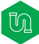
Complete Electricity & Plumbing Fittings