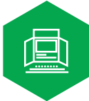
Space for Ad Display