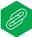
Strong & Durable Structure