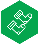
Branded Internal Fittings