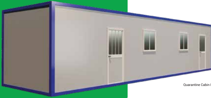
Quarantine Cabin Exterior