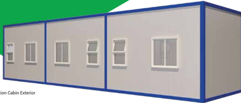
Isolation Cabin Exterior