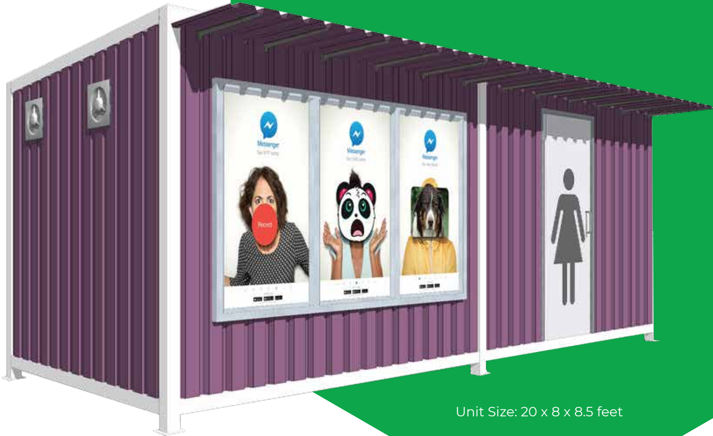
Unit Size: 20 x 8 x 8.5 feet