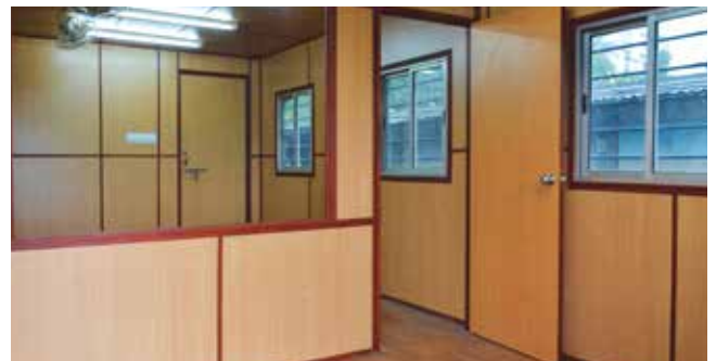
Manager cabin with internal partition