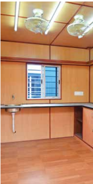
Office cabin with pantry