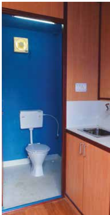
Office cabin with attached toilet