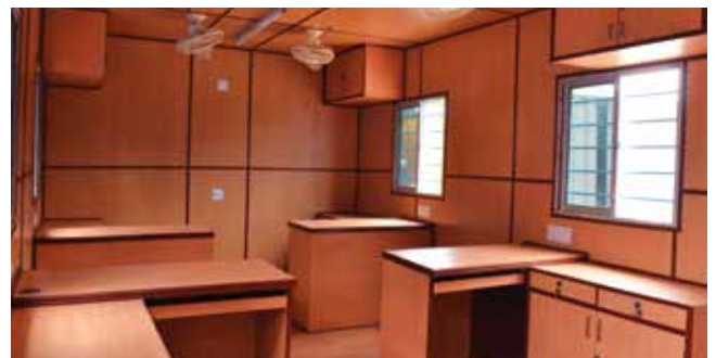
Office cabin with individual workstations