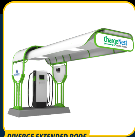
DIVERGE EXTENDED ROOF