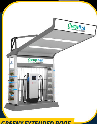
GREENY EXTENDED ROOF