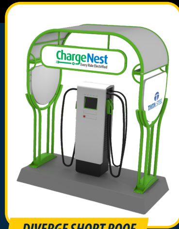
DIVERGE SHORT ROOF