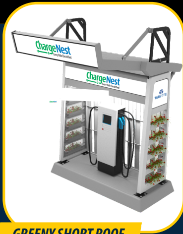
GREENY SHORT ROOF